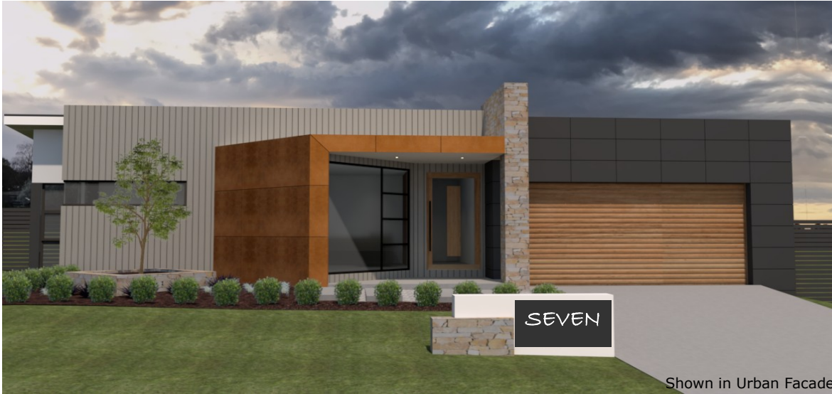
Shown in Urban Facade